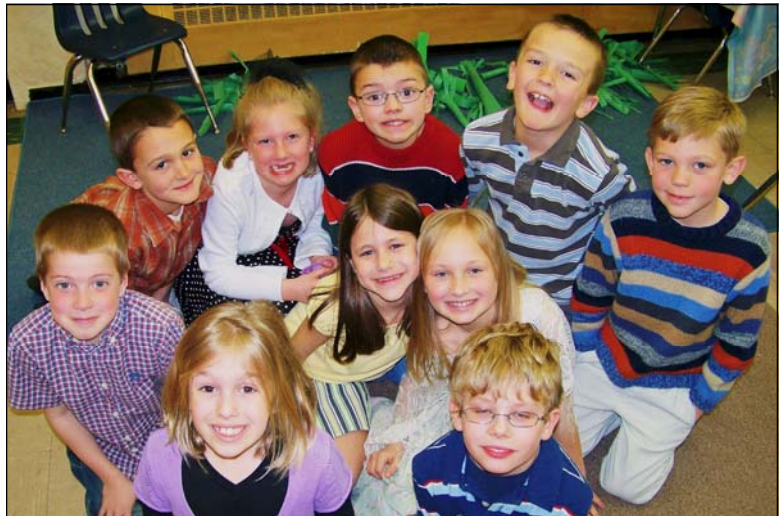
How can you say no to these faces?