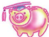
DUMC COLLEGE SCHOLARSHIP

We have a number of recent high school graduates going on to college this fall as well as our returning college students. Our college students are an important part of our DUMC family and we know how much they would thankfully welcome your charitable contributions to the scholarship fund.